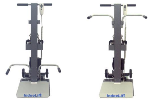
Removable Rise-Assist Handles Shown in Lower and Upper Mounting Positions

IndeeLift's patented HFLs (Human Floor Lifts) lift a fallen person from the floor. After a fall, the HFL-FTS easily lifts a person to a seated or standing position without risk of injury to themselves or any helper. In the home, the HFLs allow for floor-to-stand fall recovery without outside assistance, allowing mobility challenged individuals to remain in their homes.